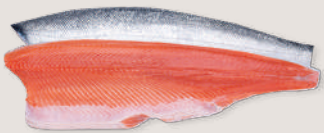
Coho / TRIM C/D FILLETS